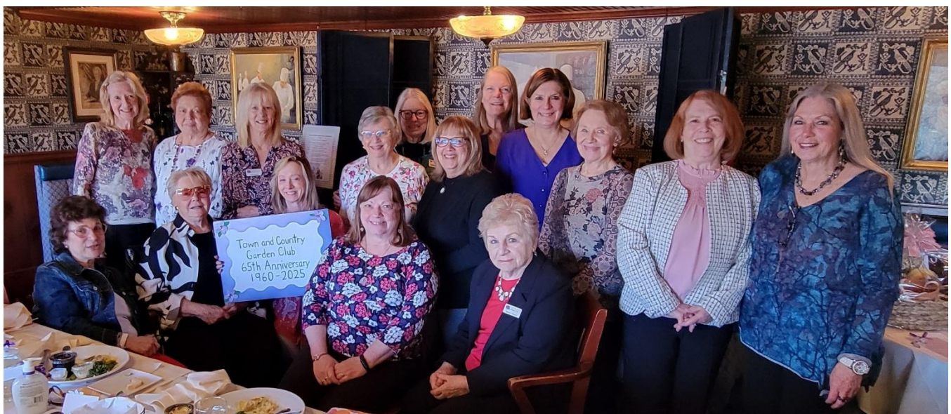
Town and Country Garden Club Members at the Installation Luncheon, April 2025.

Members will meet for breakfast and a business meeting at the Pegasus Restaurant before heading to WNY's Premier Garden & Landscape Show, Plantasia. We will attend educational seminars, shop at vendor booths, and enjoy the flower show offered by the Federated Garden Clubs of NYS, District 8.