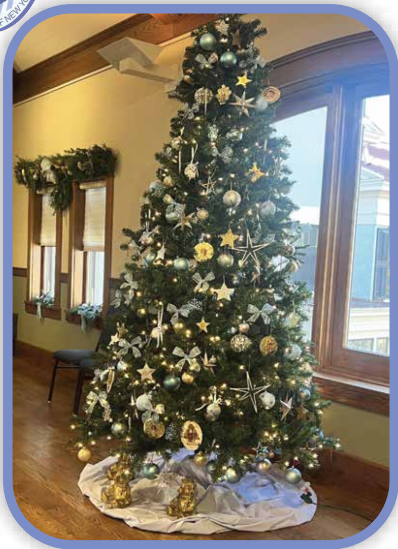
Christmas tree decorated by Lancaster Garden Club

Volume 72 Number 1 January, February, March 2026